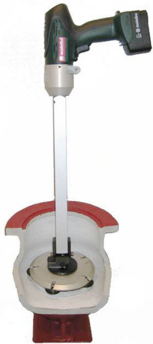
For globe valves

Hand held for very quick and easy use. For globe-, gate-, control- and safety valves.