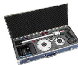
LarsLap FL-CH ELACC in the case .