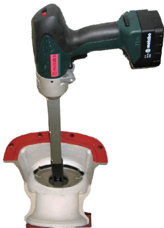
For gate valves