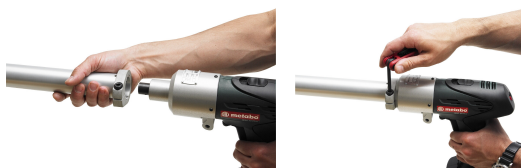
FL-H is easy to change from grinding gate valves to grind globe valves.