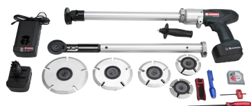
Machine parts for LarsLap FL-H BC. Driving-heads with individual driven grinding discs.